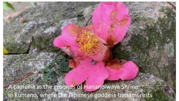
A camellia in the grounds of Hananoiwaya Shrine in Kumano, where the Japanese goddess Izanami rests